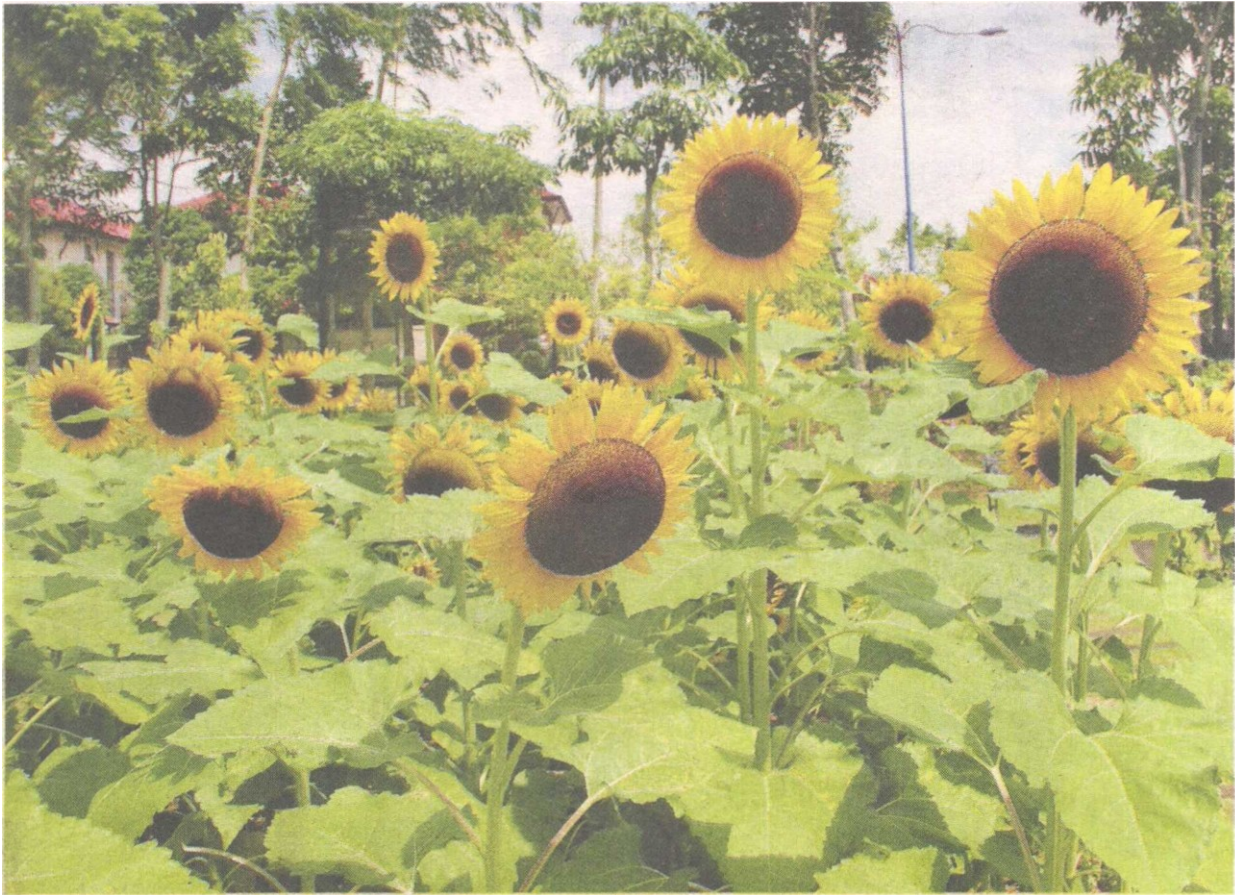
Beautiful sight: Be surrounded by blooming sunflowers at the Sunburst Plateau.